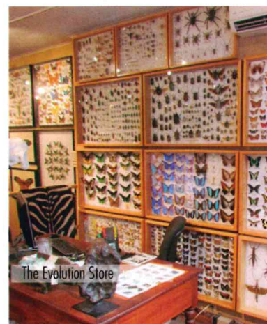
The Evolution Store