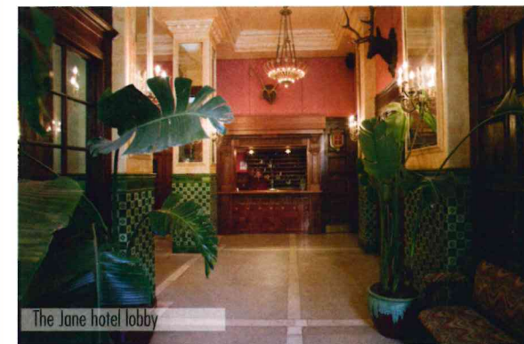
The Jane hotel lobby