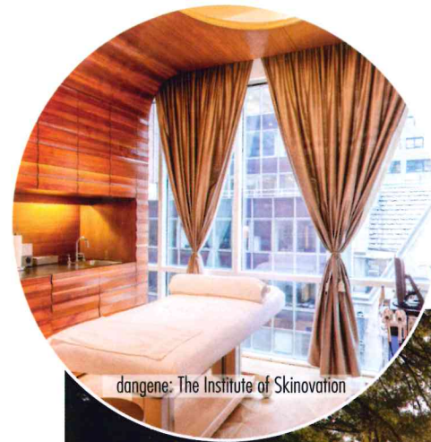
dangene: The Institute of Skinovation