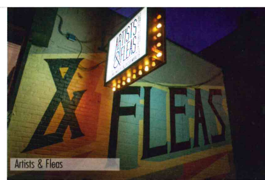
Artists & Fleas