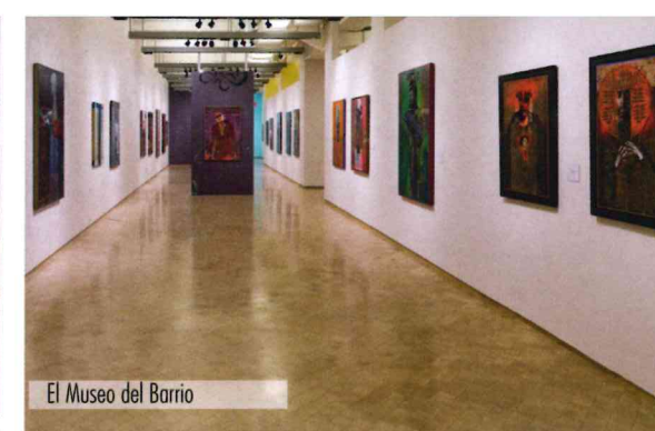
El Museo del Barrio