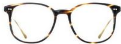
THE EYES HAVE IT Oliver Peoples' Scheyer unisex eyegless frame ($300) is available with blue-light protection lenses at Drs. Farkas, Kassalow, Resnick & Associates.